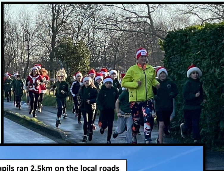
Year 5 and 6 Pupils ran 2.5km on the local roads

Another amazing achievement for our Cherry Tree community! All funds raised will go towards new outdoor play equipment to replace our beloved pirate ship.