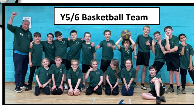
Y5/6 Basketball Team