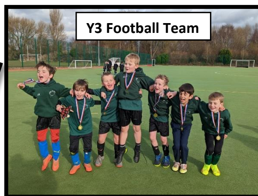
Y3 Football Team