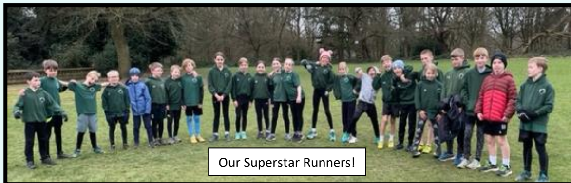
Our Superstar Runners!