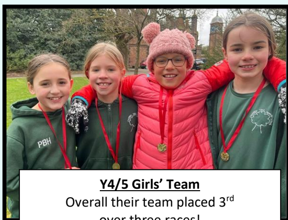
Y4/5 Girls' Team Overall their team placed 3 rd over three races!