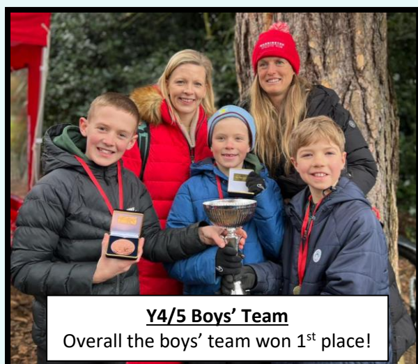
Y4/5 Boys' Team Overall the boys' team won 1 st place!